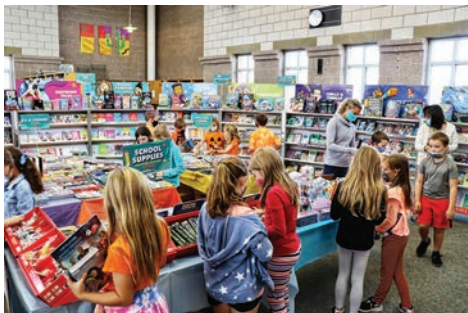
PTO Book Fair