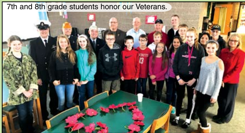
7th and 8th grade students honor our Veterans.

We invited our local Senior Citizens for lunch and entertainment for their November meeting. The Salem School Preschool performed for the Senior Citizens. The students were all dressed up in turkey costumes that they made themselves. They sang songs about being thankful, November, and turkeys.