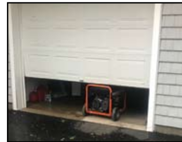
Generator under the garage door ventilated exhaust into the dwelling by natural ventilation.

Police said the four people were rushed to Danbury Hospital and one of the patients was then transferred for more advanced care at an out-of-state hospital. Officials did not identify the victims.