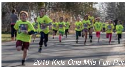
2018 Kids One Mile Fun Run

very popular with the students. At the completion of the program, Trooper LaRue holds a graduation where he presents certificates, prizes, and refreshments. We are proud to continue supporting such a worthy program into the future.