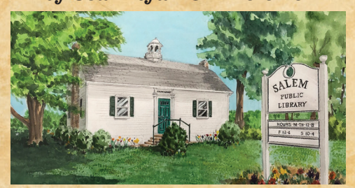
Special Thanks to