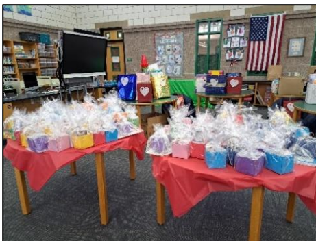
Gifts to the Seniors from PTO