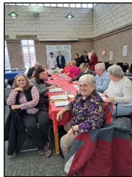
Seniors that attended the meeting at Salem School