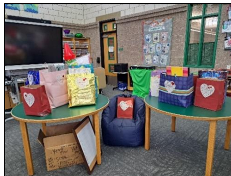
Gifts donated to the Salem Teachers