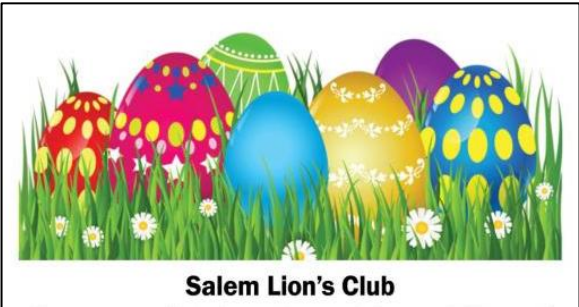
Salem Lion’s Club

(Free for Salem youth; toddlers up to and including grade 4)