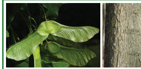
Norway Maple (Deciduous Tree)

Large tree with rounded crown. Opposite, 5-lobed leaves with long pointed tips and bright yellow-green flower clusters with wide-spreading winged fruit. Gray or brown bark that becomes rough and furrowed into narrow ridges with age. Milky white sap in leaves and stems.