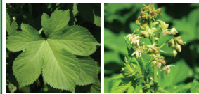
Japanese Hop (Annual Vine)

Fun Fact: Fruits are edible with a slimy consistency and bland taste