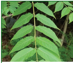
Tree of Heaven