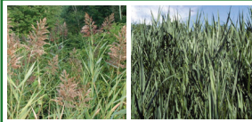
Common Reed (Perennial Grass)

Long, lance-shaped upright to arching, flat or rolled, gray-green leaf blades that are smooth with parallel veins. Hollow, smooth stems with purple-brown plume-like flowers