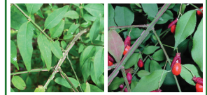
Burning Bush (Deciduous Shrub)

Fun Fact: Nicknamed "stinking sumac" due to its foul smell