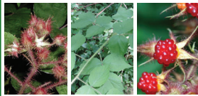
Wineberry (Deciduous Shrub)

Fun Fact: Seeds are viable in soil for up to three years!