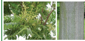
Tree of Heaven (Deciduous Tree)

Dense woody shrub with smooth, elliptical or oblong leaves and white, yellow, or green flowers with thin, delicate petals with five stamens, one pistil, and fleshy red or yellow paired spherical berries that are poisonous to humans. Stems are hollow and tan-colored on the inside.