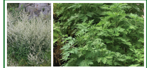
Common Mugwort (Perennial Herb)

Large tree with rounded crown. Opposite, 5-lobed leaves with long pointed tips and bright yellow-green flower clusters with wide-spreading winged fruit. Gray or brown bark that becomes rough and furrowed into narrow ridges with age. Milky white sap in leaves and stems.