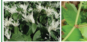
Japanese Knotweed (Perennial Herb)

Fun Fact: Berries are edible and have a tart flavor