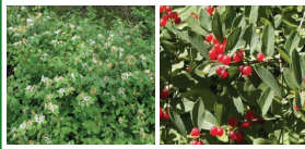
Morrow's Honeysuckle (Deciduous Shrub)

Fun Fact: Seeds have a laxative effect on birds!