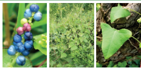
Mile-a-Minute (Annual Vine)

Fun Fact: Roots are medicinal and has been used to lower fevers