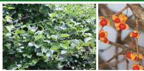
Oriental Bittersweet (Deciduous Vine)

Alternate, finely toothed ovate to round glossy leaves on dark brown to brown striated, twining, almost corky, bark with yellow-cased fruit that split open revealing bright fleshy, red interior.