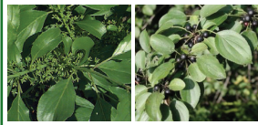
European Buckthorn (Deciduous Shrub)

Fun Fact: Fruits can be eaten raw or made into jam!