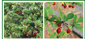
Japanese Barberry (Deciduous Shrub)

Egg-shaped, smooth edged leaves in clusters on reddish-brown, ridged stems with small, dangling yellow flowers in clusters of two to four and hard, elliptical bright red seeds.