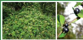
Japanese Honeysuckle (Semi-evergreen Vine)

Fun Fact: Vines are a good source for basket weaving!