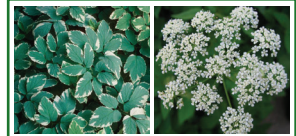
Goutweed (Perennial Ground Cover)

Fun Fact: Most likely introduced through its use as packing material for porcelain