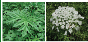
Giant Hogweed (Perennial Herber)

Fun Fact: Each flower contains 10 to 24 seeds!