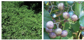
Porcelainberry (Deciduous Vine)

Fun Fact: Mugwort pollen is a common cause of allergies!