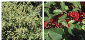
Autumn Olive (Deciduous Shrub)

Fun Fact: Controlled populations result in fewer mice and ticks!