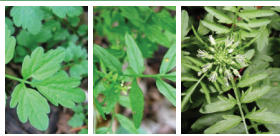
Narrowleaf Bittercress (Biennial Herb)

Fun Fact: Leaves are fatal to monarch caterpillars