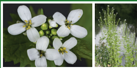
Garlic Mustard (Herbaceous Biennial)

Fun Fact: Used in traditional Chinese medicine