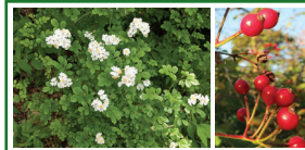
Multiflora Rose (Deciduous Shrub)

Basal rosette with rounded leaves and toothed margins that become strongly toothed and triangular. Small and alternately arranged four-petaled white flowers. Leaves and stems give off garlic odor when crushed.