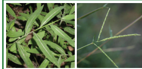
Japanese Stiltgrass (Biennial Herb)

Fun Fact: Dame's Rocket is often sold in wildflower mixes