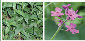
Dame's Rocket (Flowering Biennial/Perennial)

Fun Fact: Flowers once in its lifetime and dies after producing seeds!