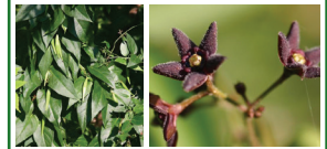
Black Swallow-wort (Deciduous Vine)

Fun Fact: Is one of the world's 100 worst invasive species!