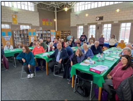
Seniors enjoying the show