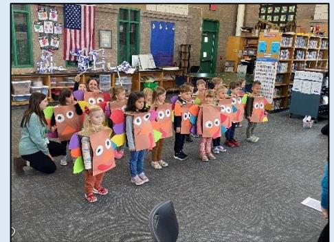
The PK kids dressed as turkeys entertained the Seniors with songs. CUTENESS OVERLOAD!!!