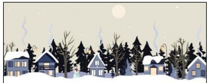
(Sponsored by the Friends of the Salem Library)

Register at the circulation desk beginning January 22, 2024 to receive your reading log. Read as much or as little as you would like! Turn in your reading log by March 4, 2024 to receive a raffle ticket (1) and a free book of your choice.