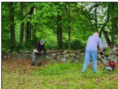
Mowing & Weeding