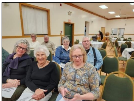
Some of the audience