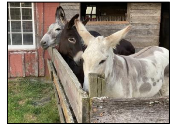
Views of the Farm