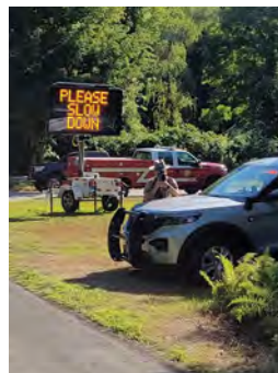
Thanks to the teamwork of our staff and citizens, the Town was able to minimize the inconveniences and enhance public safety.