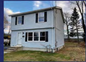
New London SOLD $200,000