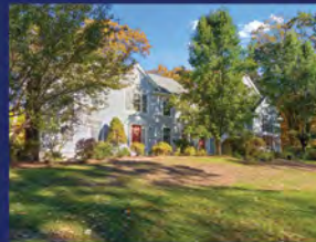
Colchester SOLD $438,000