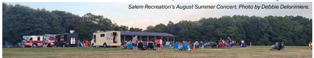
Salem Recreation's August Summer Concert.

Our hard-working volunteer Recreation Commissioners have been busy working on fun events this summer, including some amazing summer concerts under the pavilion at the Salem Community Park!