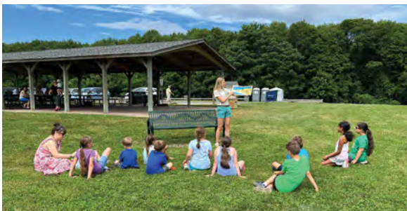
Presenter from the Kellogg Environmental Center