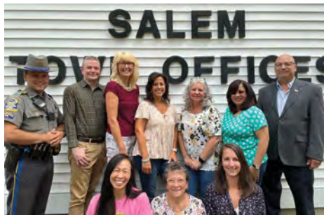
Town Hall Staff: We're here to serve.