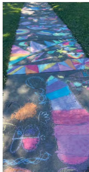
Chalk Walk on June 29, 2022