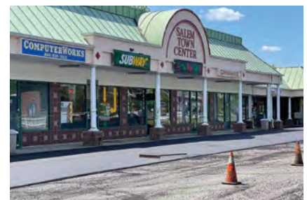
The new owners of the Salem Town Center, located at 1 New London Road, have been busy working with Town Hall Staff and making upgrades to the plaza, including re-paving the parking lot.