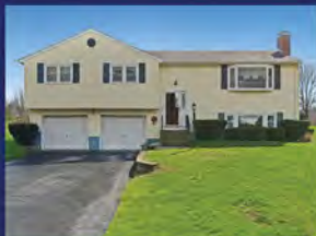
Salem FOR SALE $324,900

Are you ready to SELL and join these happy clients? My property spotlight marketing plan can help you net more on the sale of your home. From start to finish, your home will be uniquely cared for and expertly marketed. Contact me today!