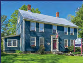
Colchester SOLD $380,000