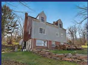
Montville SOLD $233,000