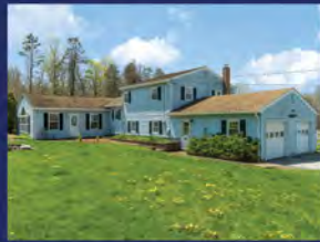
Salem SOLD $300,000