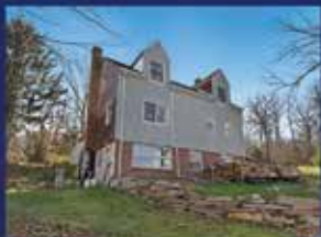
Montville UNDER DEPOSIT in 7 Days