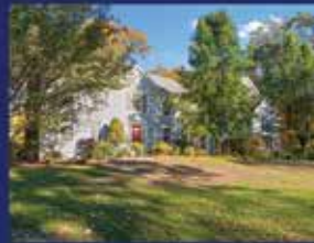
Colchester SOLD $438,000