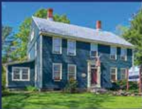
Colchester SOLD $380,000