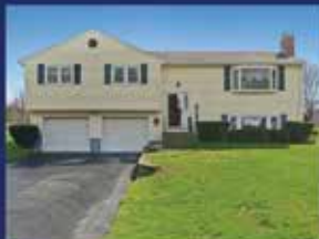
Salem UNDER DEPOSIT in 12 Days

Are you ready to SELL and join these happy clients? My property spotlight marketing plan can help you net more on the sale of your home. From start to finish, your home will be uniquely cared for and expertly marketed. Contact me today!