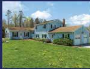
Salem SOLD $300,000