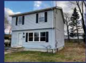
New London SOLD $200,000