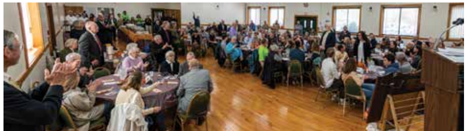
Unsung Heroes Awards Banquet.