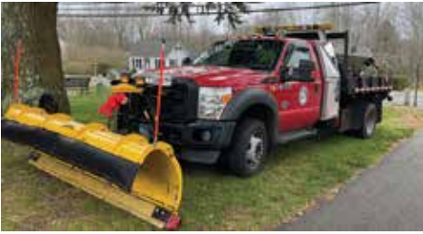
Salem Public Works Department crew members have been working hard to prepare for winter