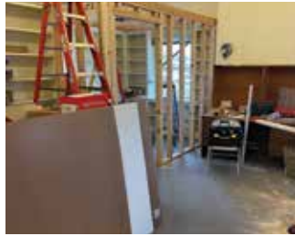
Salem Public Works Crew members have been working to install an ADA accessible restroom in the old Salem Library so the building can be used for programs and meeting space.