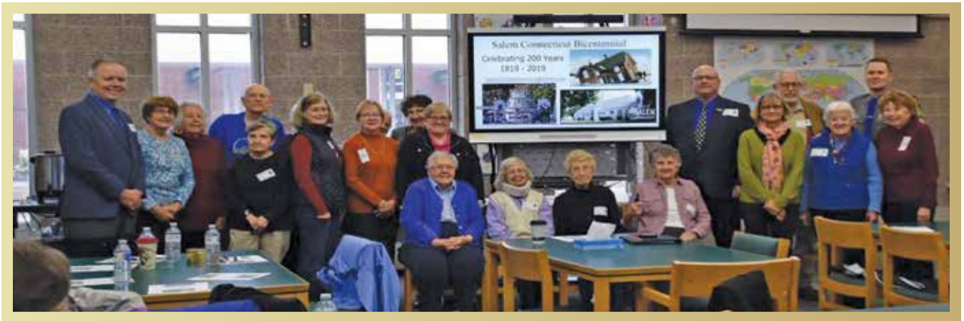
The Salem Seniors meeting at the Salem School