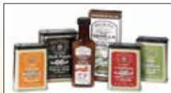
GOURMET FOODS, EXTRACTS & SPICES