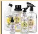
SAFE HOME CLEANING PRODUCTS